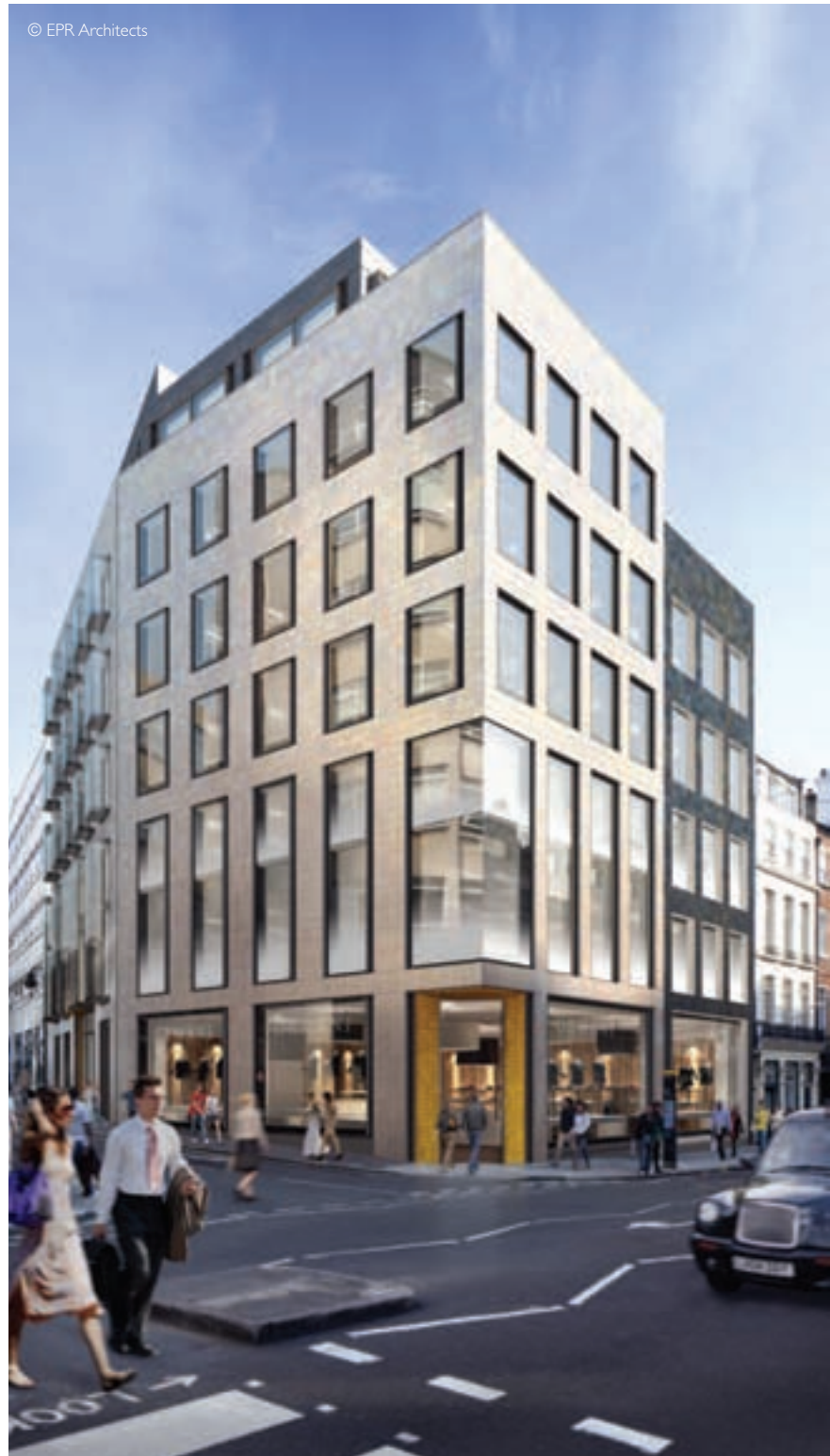
The high-quality finish of the building reflects the area's great artisan heritage