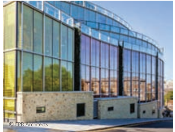
John Street, American Express’s purpose-built new development in Brighton (above). On the building’s exterior are some 15,000 of her handmade, hand-fired ceramics – a highlight feature designed as a story-telling tool for the community.