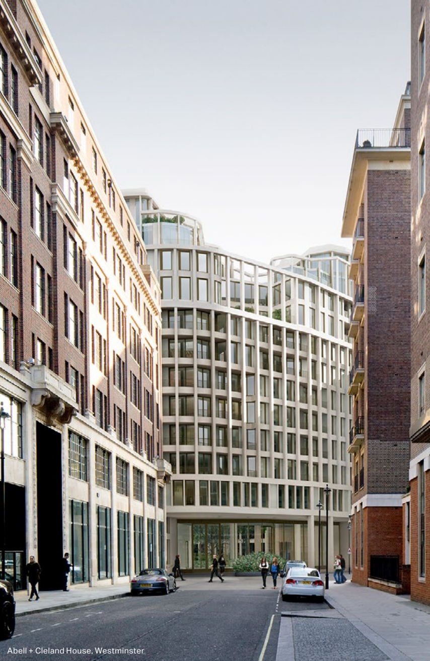
Abell + Cleland House, Westminster