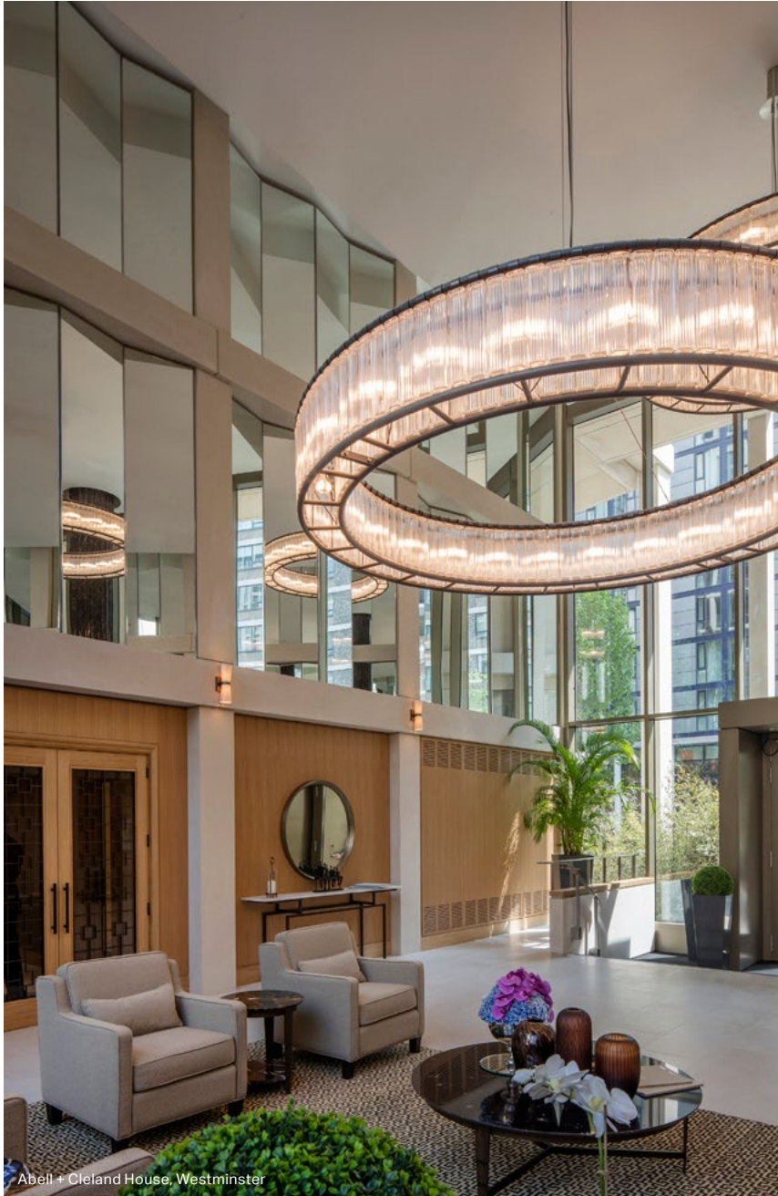
Abell + Cleland House, Westminster

Our use of BIM technology to manage the design process of both consultants and sub-contractor information has been essential in the delivery of the buildings highly complex façades and numerous internal configurations.