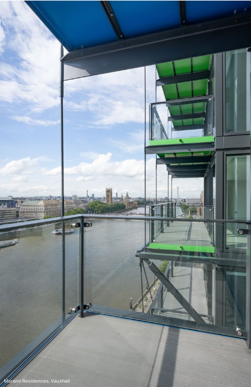
Merano Residences, Vauxhall