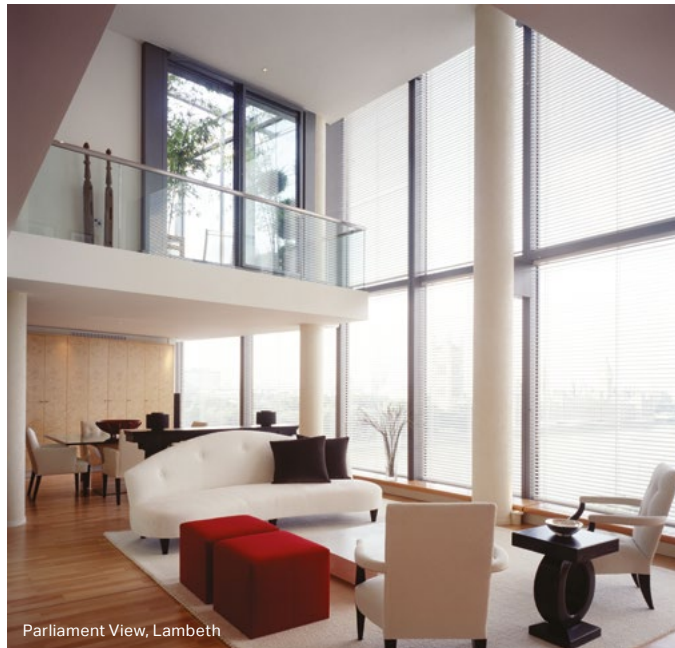
Parliament View, Lambeth