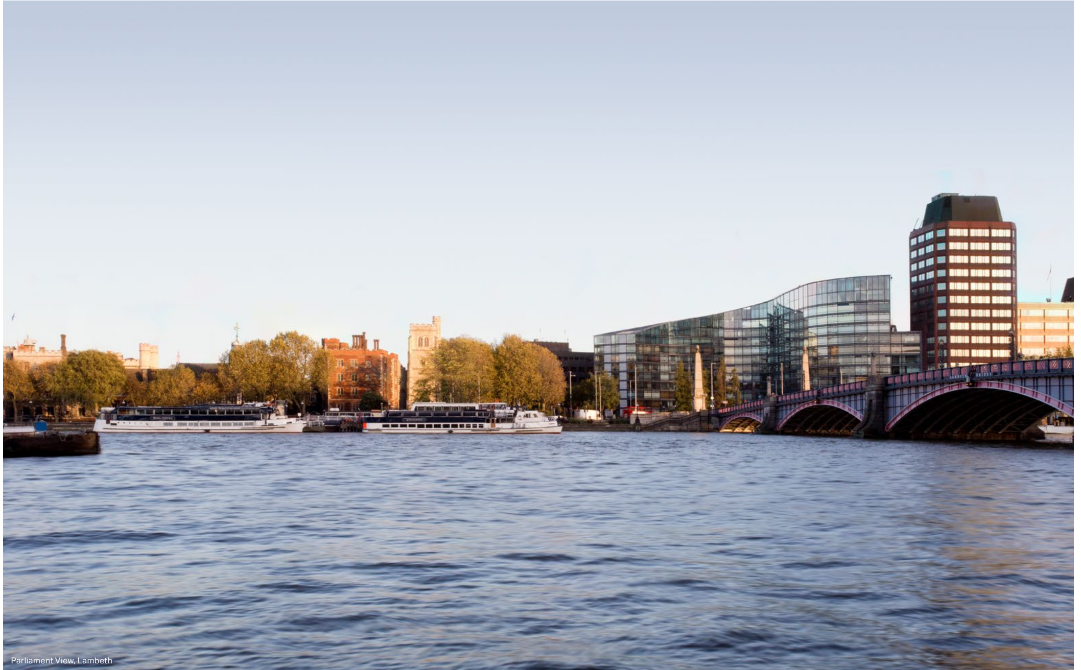
Parliament View, Lambeth