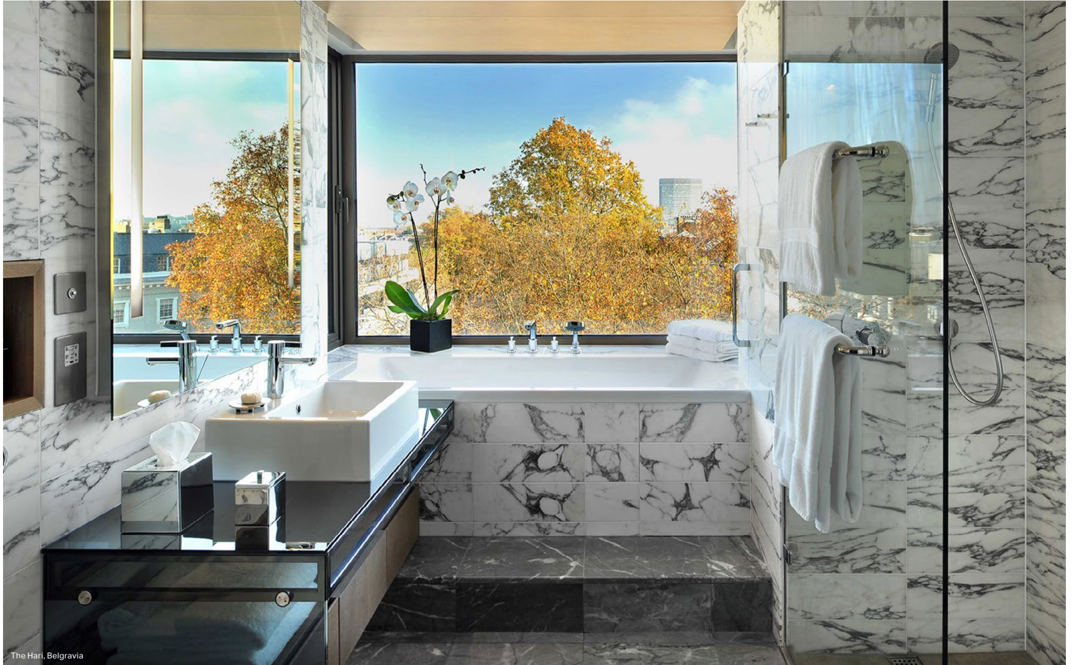
The Hari, Belgravia