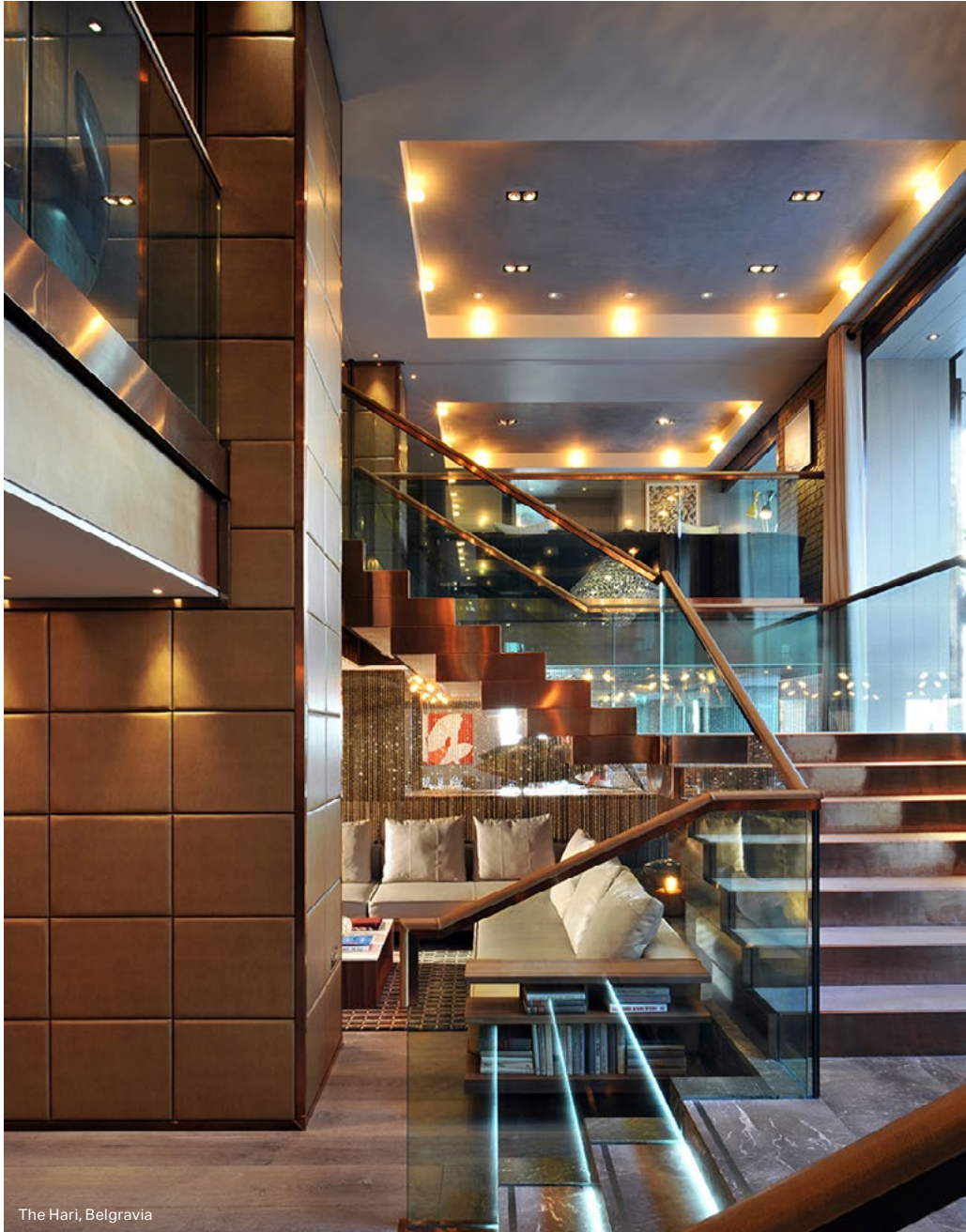
The Hari, Belgravia

The flow of spaces between public areas is visually and practically seamless, forming an immediate sense of arrival well before guests reach their rooms. The specific use of materials is an essential part of the design, from an external planning perspective through to the definition of spaces internally. Materials, layout and furniture have been carefully selected to address the low ceiling heights and restricted space throughout the building whilst minimising any impact on guest comfort and functionality. We worked in collaboration with interior designer Tara Bernerd & Partners, a creative partnership that resulted in an intelligent and high-end design solution.