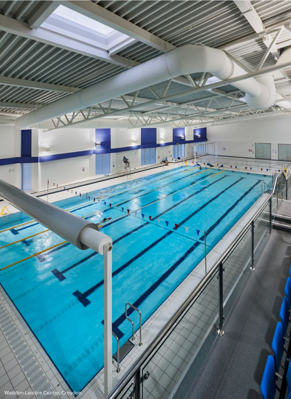
Waddon Leisure Centre, Croydon