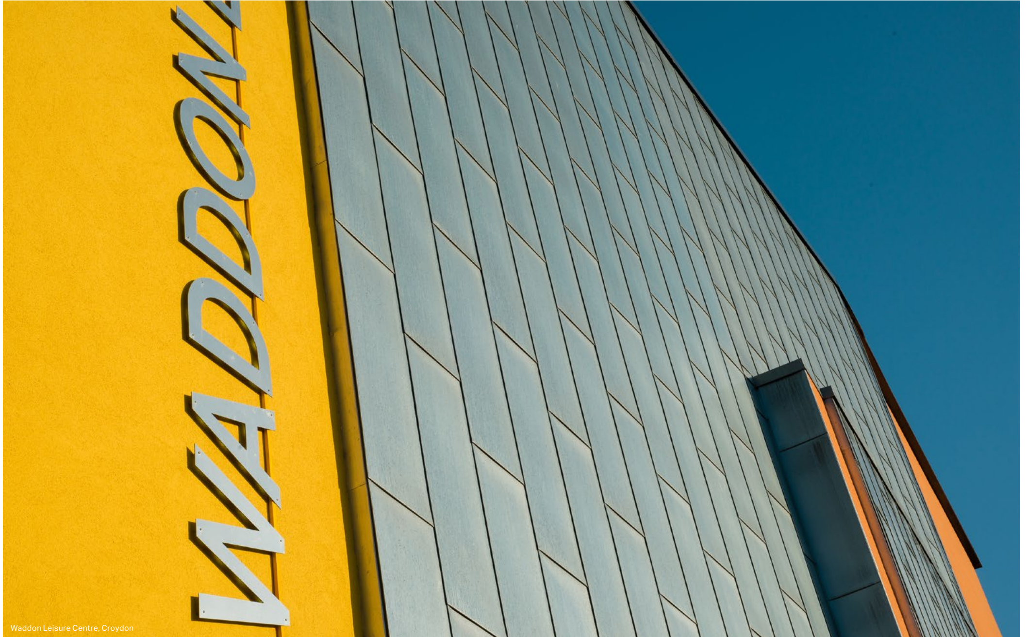
Waddon Leisure Centre, Croydon